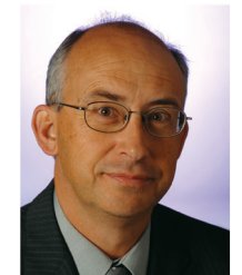
Leader of the New Democratic Party Gary Burrill

The Speaker welcomes you to the House of Assembly and asks you to note the Gallery rules on the next page.