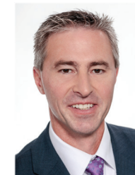
Leader of the Opposition Tim Houston