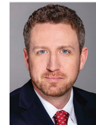
Premier Honourable Iain Rankin

The Speaker is the presiding officer of the House of Assembly and is elected by all the Members. The Speaker regulates debate according to the rules and practices of the House and casts the deciding vote in the event of a tie. The Speaker is also in charge of the administration of a wide range of programs relating to the Legislature and providing services to the Members of the House.